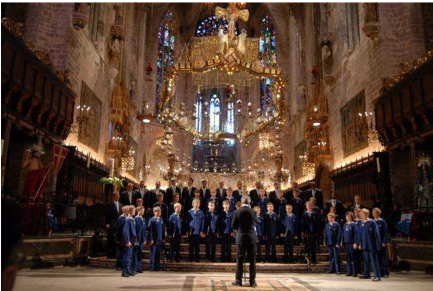
Copenhagen Royal Chapel Choir in the Cathedral of Palma in 2010