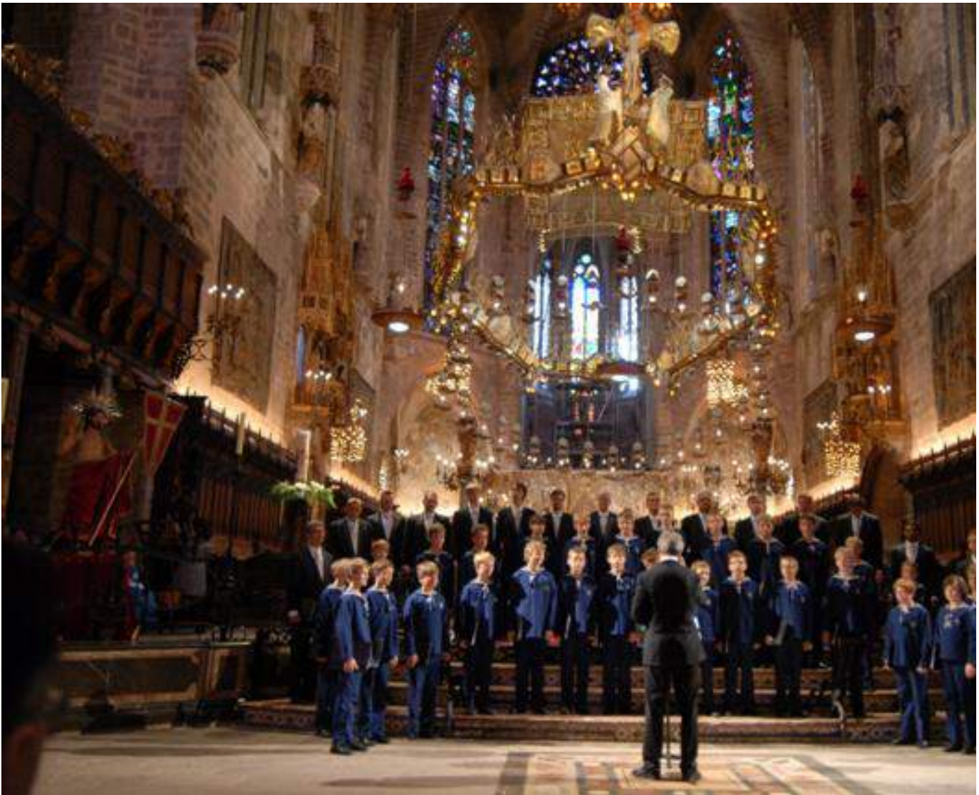
The Cathedral in Palma