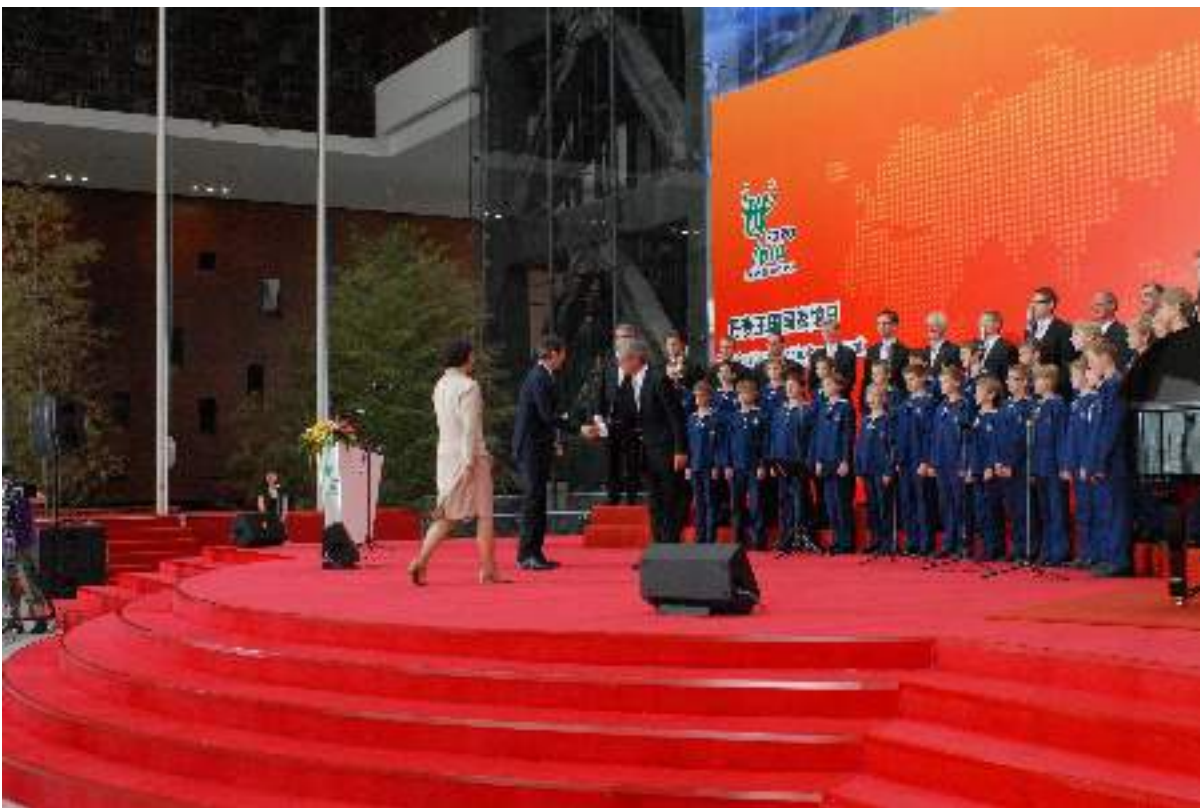
The Danish Crown Prince with Copenhagen Royal Chapel Choir