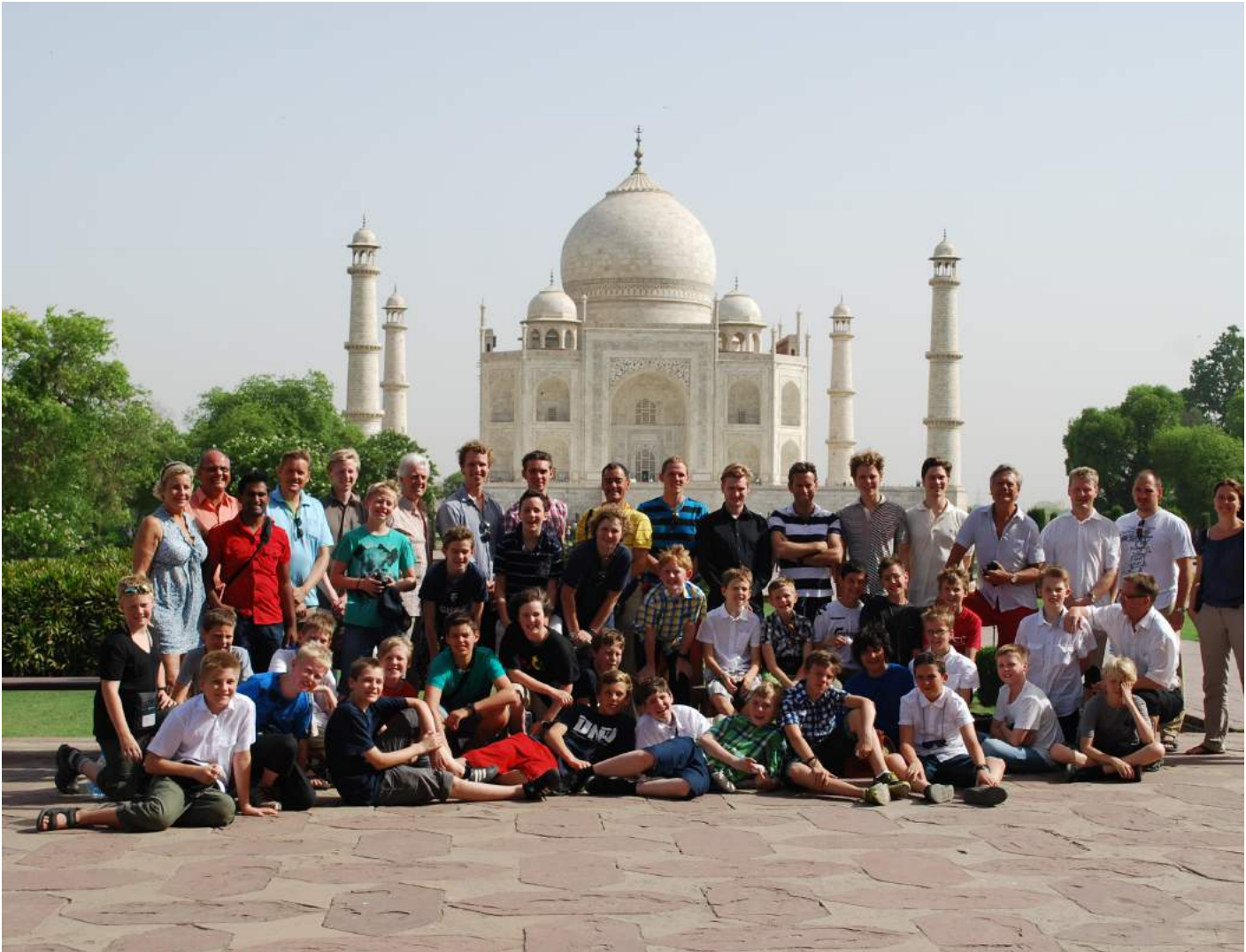
Copenhagen Royal Chapel Choir at Taj Mahal