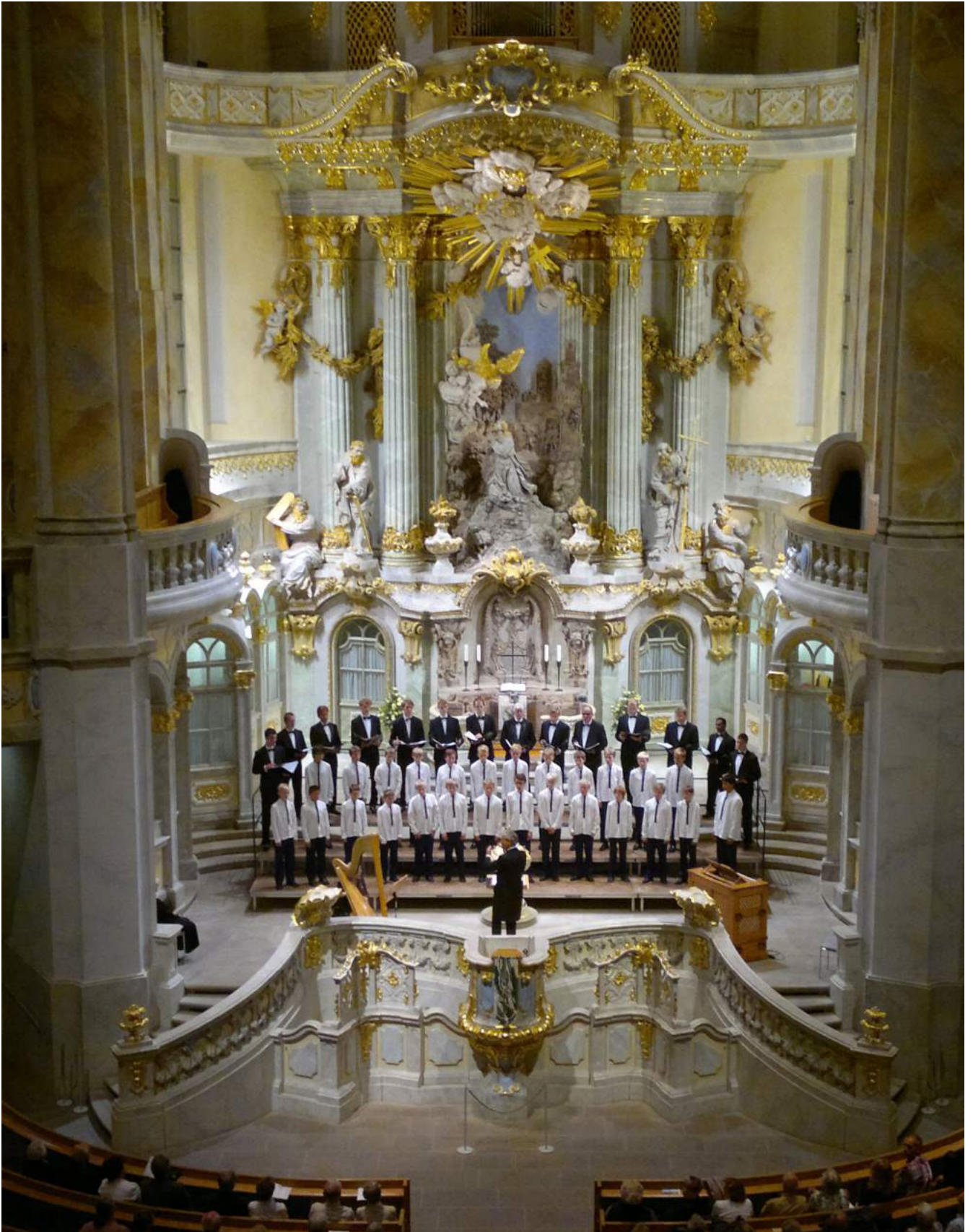
Copenhagen Royal Chapel Choir