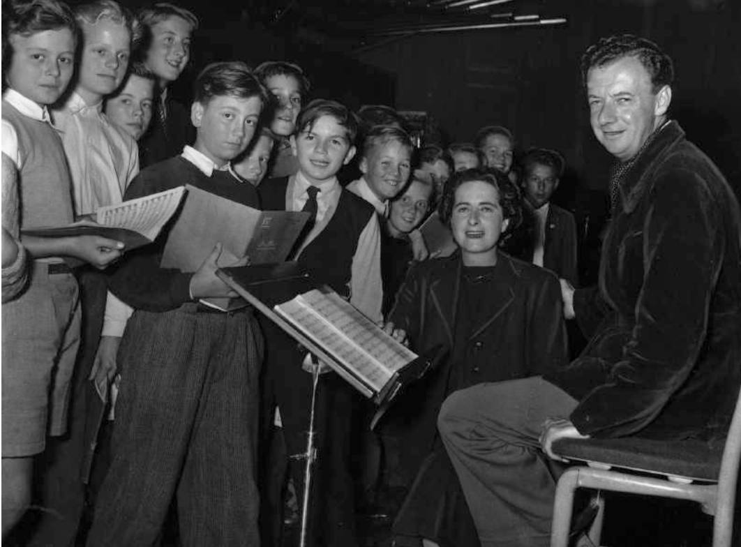
Benjamin Britten in Denmark with Copenhagen Royal Chapel Choir in 1954

Benjamin Britten: A Boy was born Gabrieli Consort & Players Copenhagen Royal Chapel Choir Paul McCreech, conductor