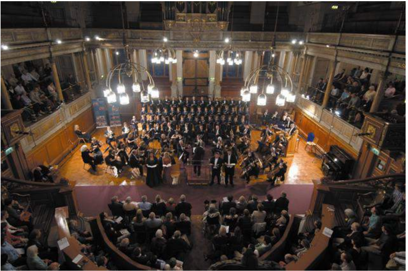
The Sheldonian Theatre, Oxford